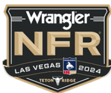
EXHIBIT E: ADDENDUM TO National Finals Rodeo Ground Rules

Under the following guidelines the “Review” system will be implemented at the 2024 Wrangler National Finals Rodeo: