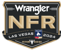
EXHIBIT A: ADDENDUM TO National Finals Rodeo Ground Rules