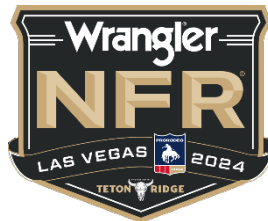
EXHIBIT D: ADDENDUM TO National Finals Rodeo Ground Rules